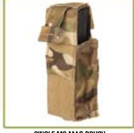
SINGLE M9 MAG POUCH MP1-M9/FB1-A-MS-FCCA