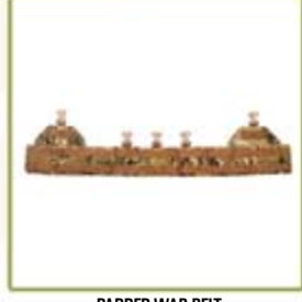
PADDED WAR BELT PWB-A-MS-FCCA