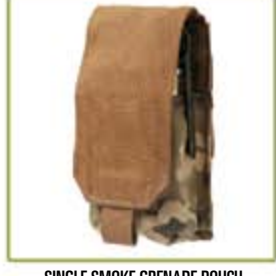
SINGLE SMOKE GRENADE POUCH SGC-1-MS-FCCA