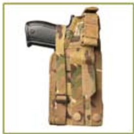
AMBIDEXTROUS HOLSTER AH-92F-ABN-MS-FCCA