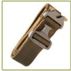
QUICK RELEASE BELT ES-QRB-FCOY