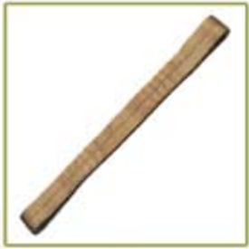
EXTRACTION-BELLY STRAP ES-BS-FCOY