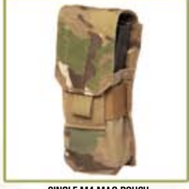
SINGLE M4 MAG POUCH MP1-M4/2-A-MS-FCCA