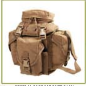
GENERAL PURPOSE BUTT PACK GB-BP-A-MS-FCCA