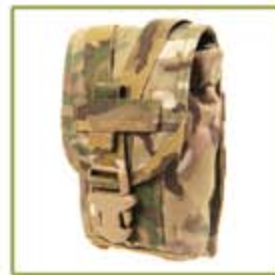
1 LITER CANTEEN POUCH CTP-1L-MS-FCCA