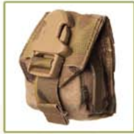
SINGLE FRAG GRENADE POUCH FGC-1-A-MS-FCCA