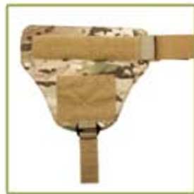
BALLISTIC DELTOÏD PROTECTOR BDP-STL-BP-FCCA