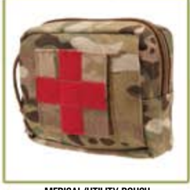
MEDICAL/UTILITY POUCH MED/UT-MS-FCCA