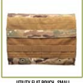
UTILITY FLAT POUCH-SMALL UFP-S-MS-FCCA