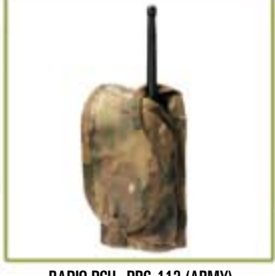
RADIO POUCH-PRC-112 (ARMY) RP-PRC112-A-MS-FCCA