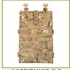
SLIM HYDRATION POUCH-50 OZ. HP-50S-W/R-MS-FCCA