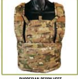
RHODESIAN RECON VEST RRS-V-MS-FCCA