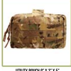
UTILITY POUCH 9" X 3" X 5" UT-935-A-MS-FCCA