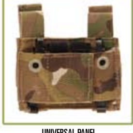
UNIVERSAL PANEL UNLP-MS-FCCA