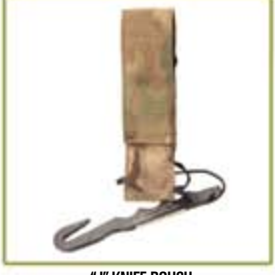
"J" KNIFE POUCH JKP-MS-FCCA