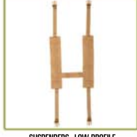
SUSPENDERS-LOW PROFILE SLP-FCCA