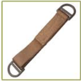
CHEST EXTRACTION STRAP ES-CES-FCOY (S,M,L,XL)