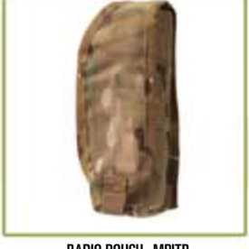
RADIO POUCH-MBITR RP-MBITR-A-MS-FCCA