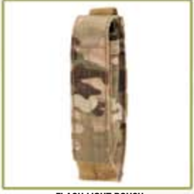
FLASH LIGHT POUCH FLP-MS-FCCA