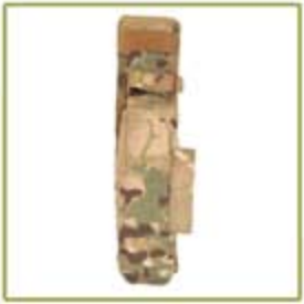
EGRESS AIR BOTTLE POUCH EAP-MS-FCCA