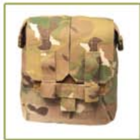
AMMO POUCH SAW 200RD W/DET TOP AP-SAW/200-MS-FCCA