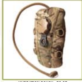
HYDRATION POUCH-50 OZ. HP-50-W/R-MS-FCCA