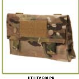
UTILITY POUCH UT-MS-FCCA