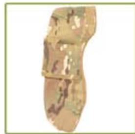
BALLISTIC SHOULDER PROTECTOR BSP-STL-FCCA